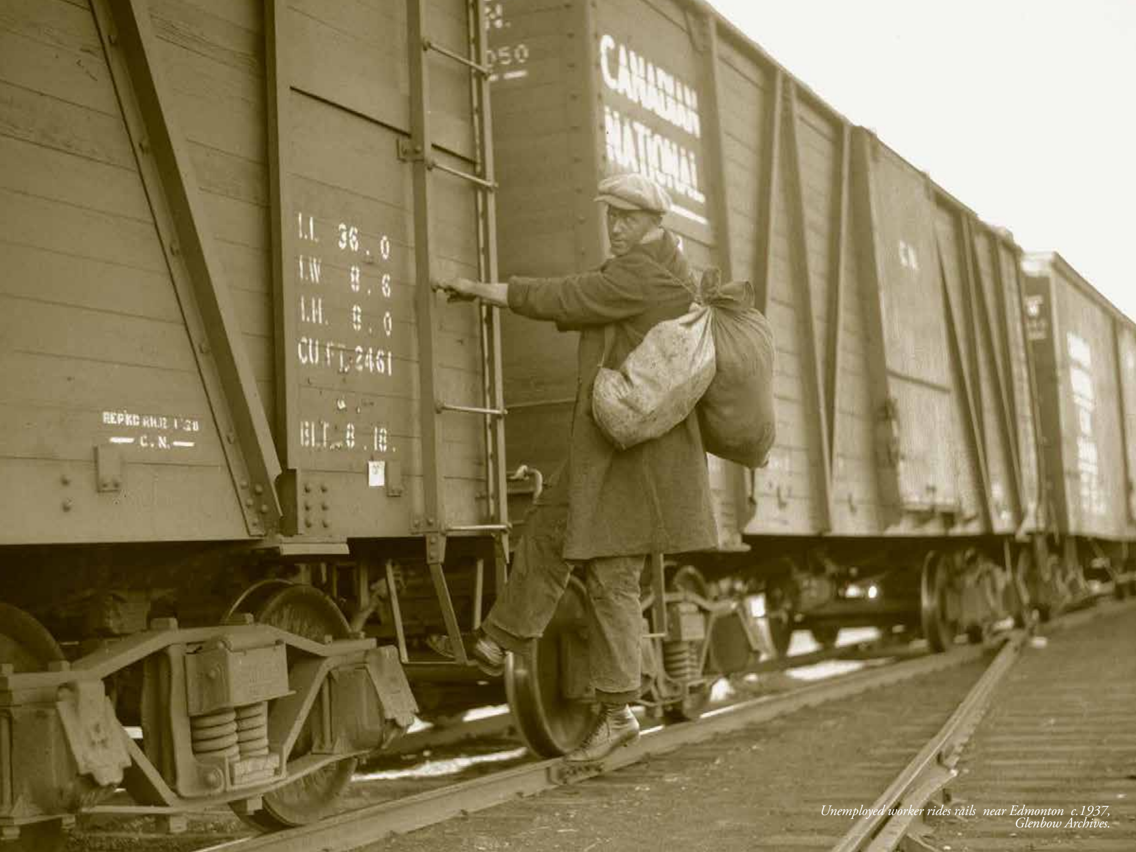
Unemployed worker rides rails near Edmonton c.1937, Glenbow Archives.