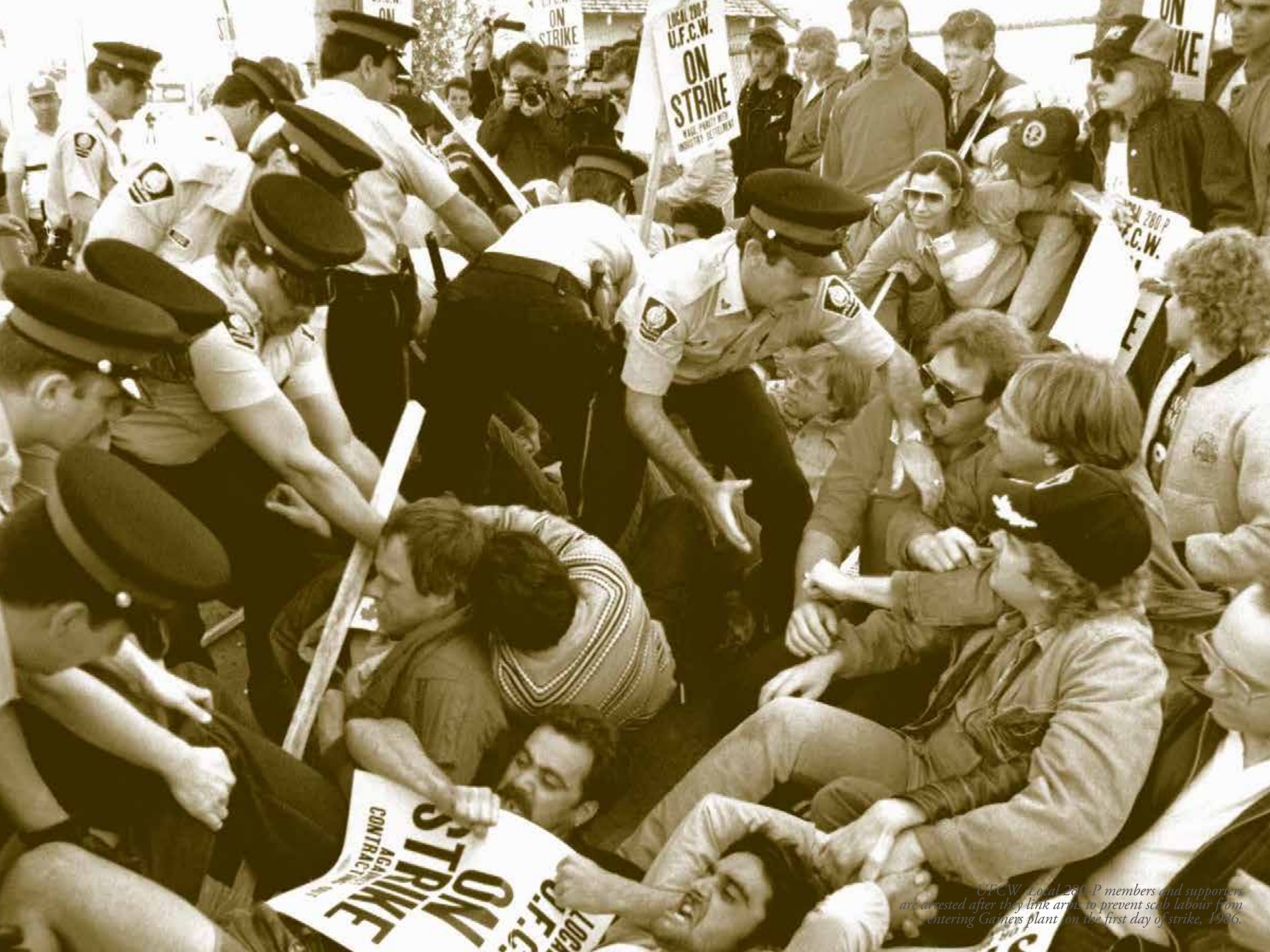
UFCW Local 280-P members and supporters are arrested after they link arms to prevent scab labour from entering Gainers plant on the first day of strike, 1986.