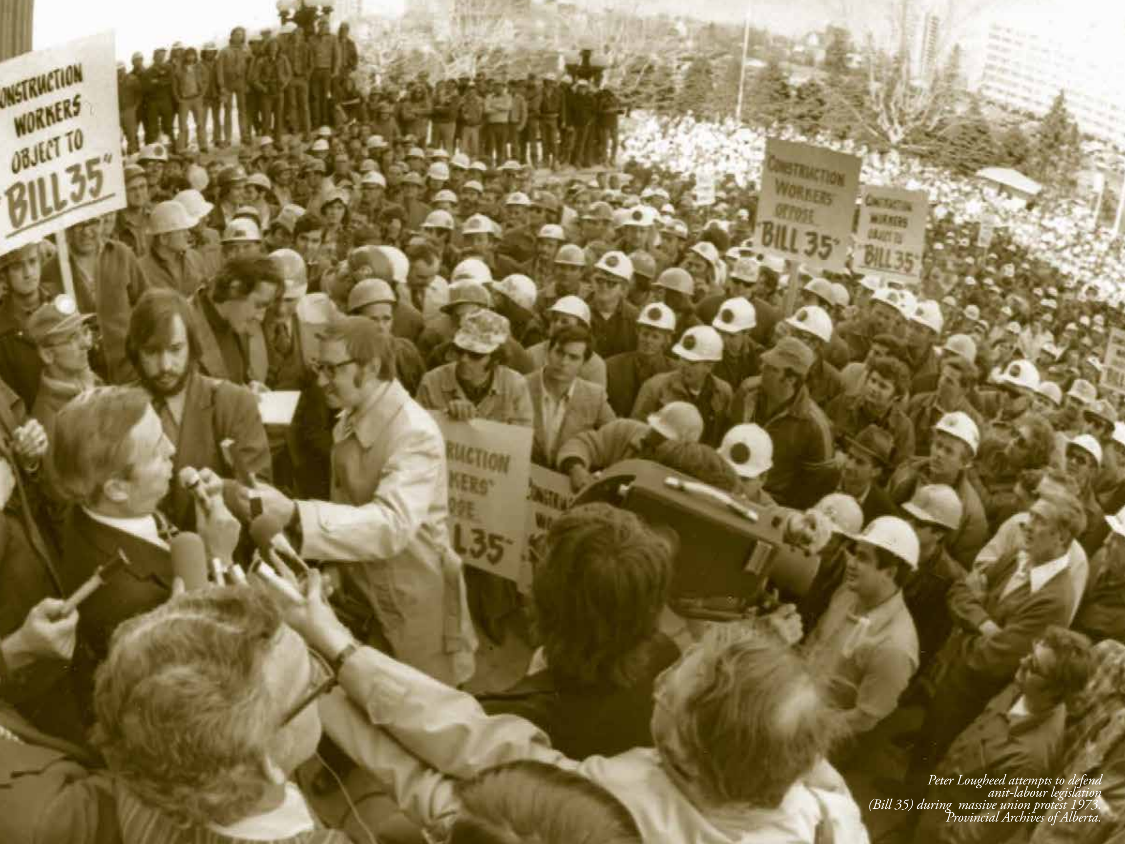
Peter Lougheed attempts to defend anti-labour legislation (Bill 35) during massive union protest 1973.