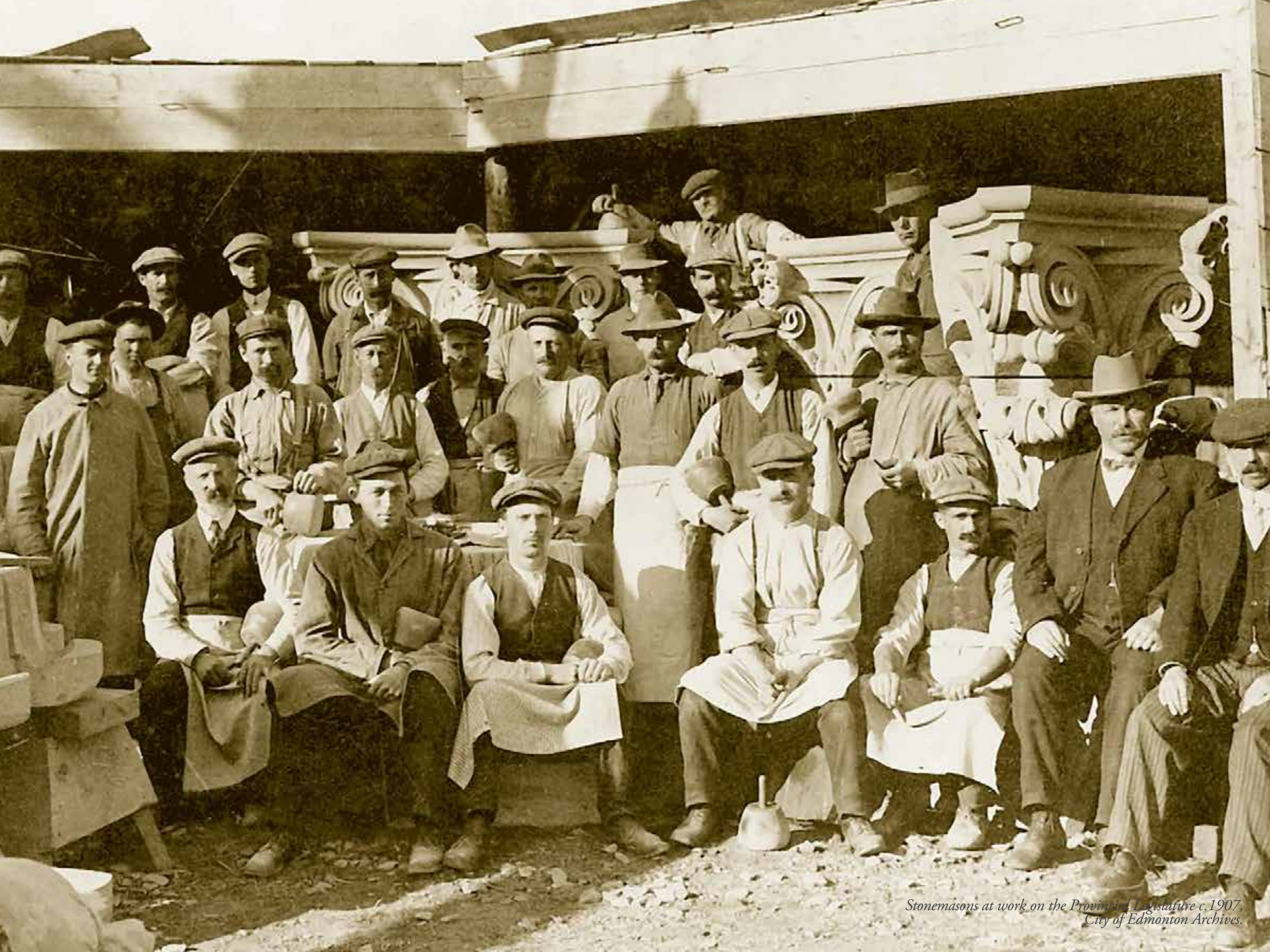
Stonemasons at work on the Provincial Legislature c.1907