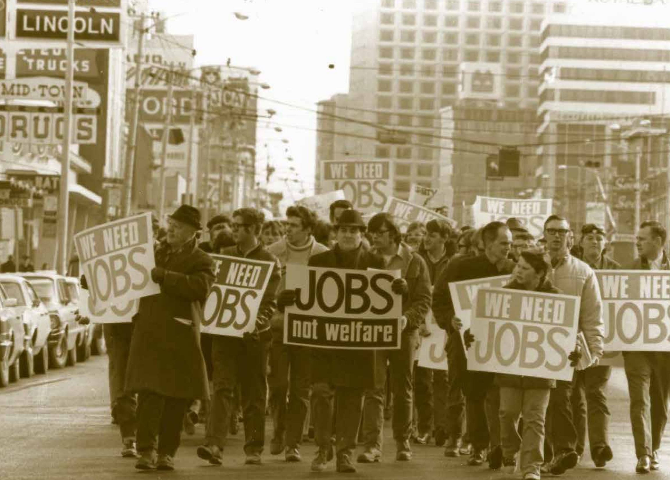
Labour sponsored unemployed march 1971, Provincial Archives of Alberta.