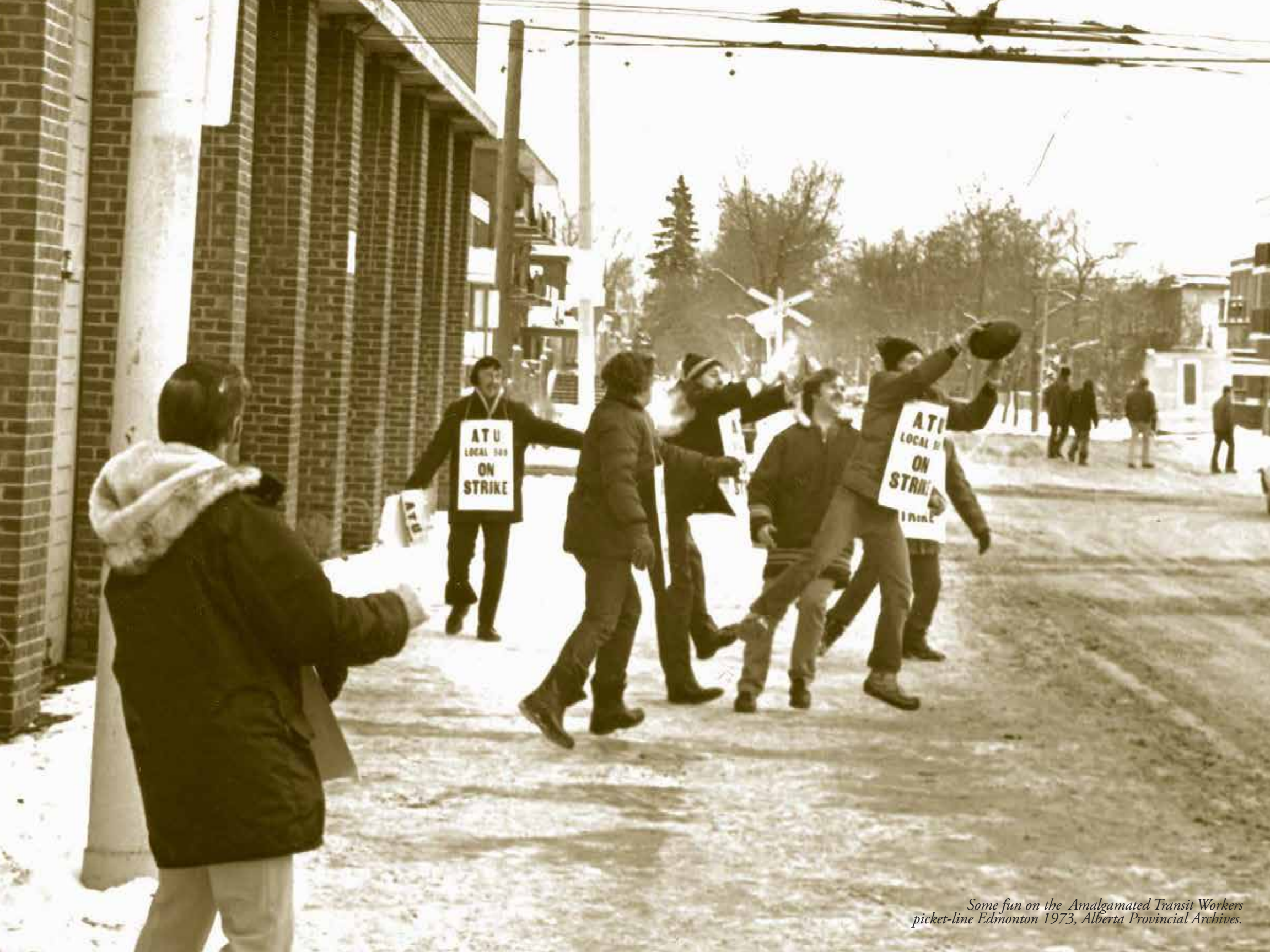
Some fun on the Amalgamated Transit Workers picket-line Edmonton 1973