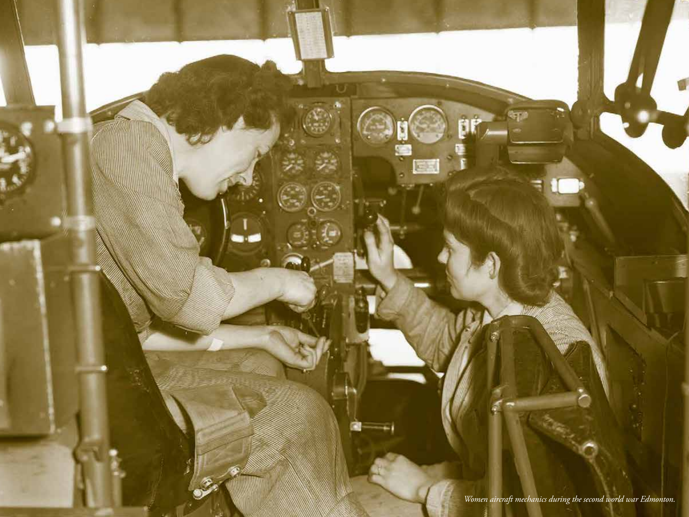
Women aircraft mechanics during the second world war Edmonton.