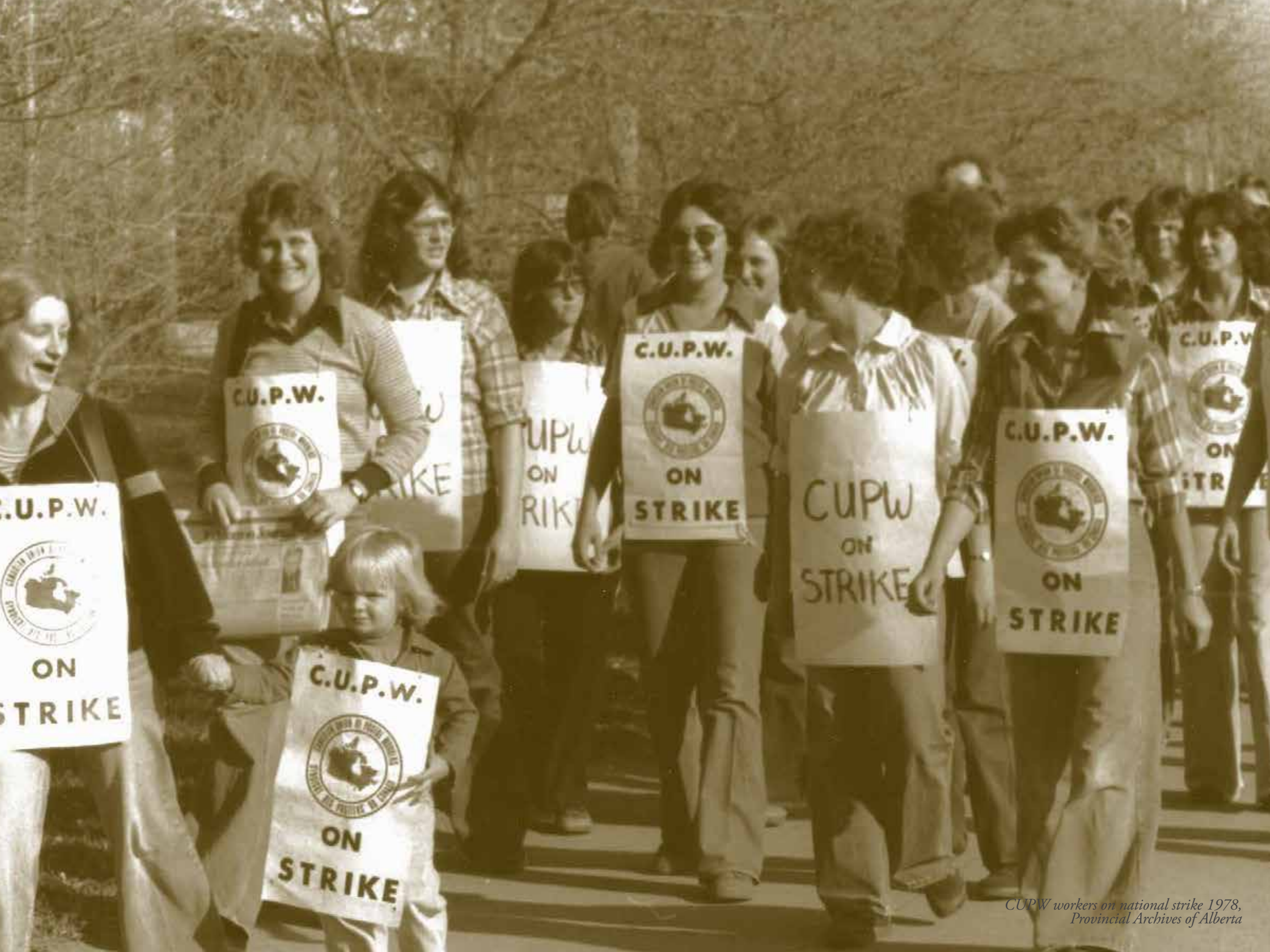
CUPW workers on national strike 1978, Provincial Archives of Alberta