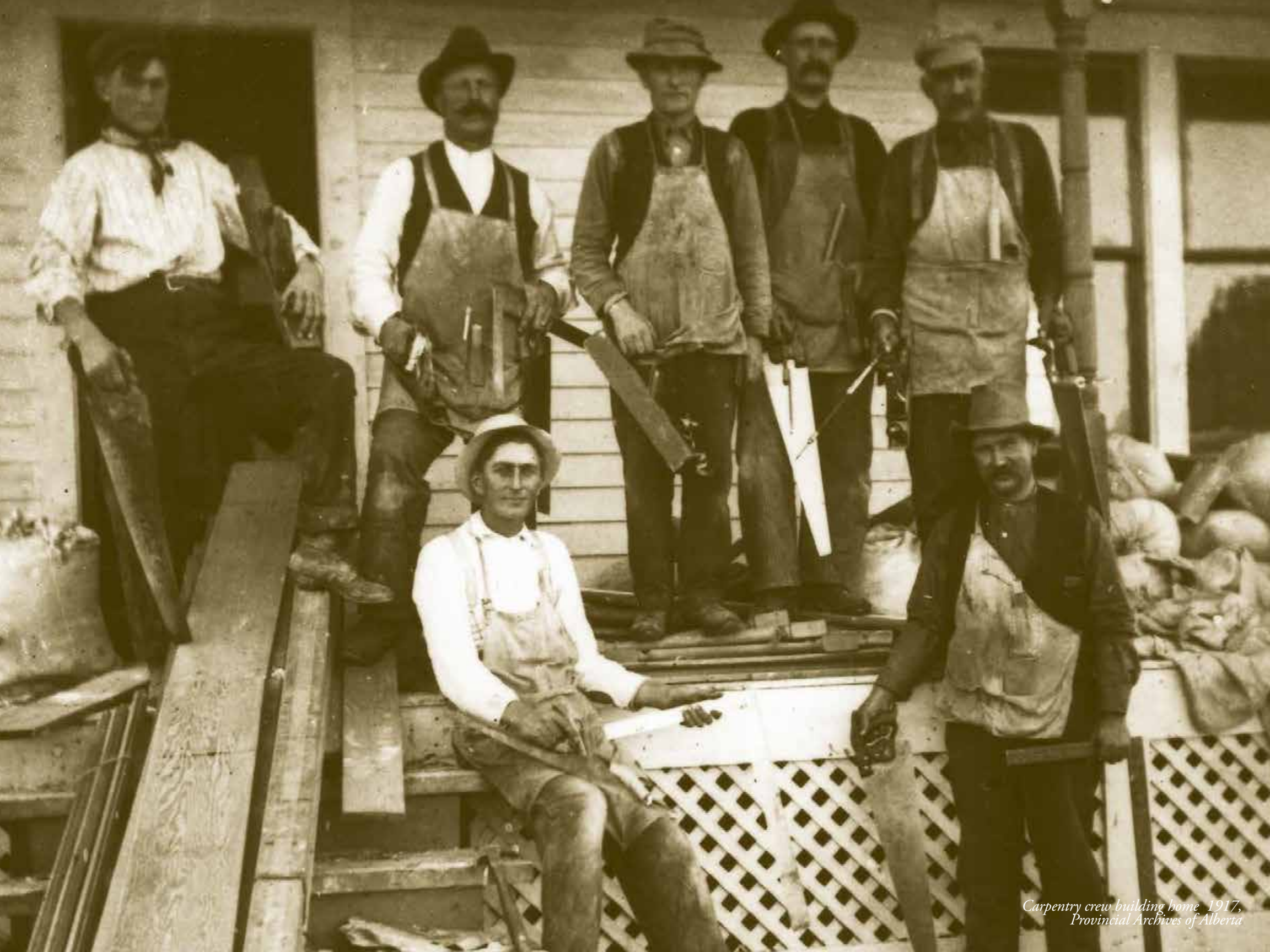
Carpentry crew building home 1917, Provincial Archives of Alberta