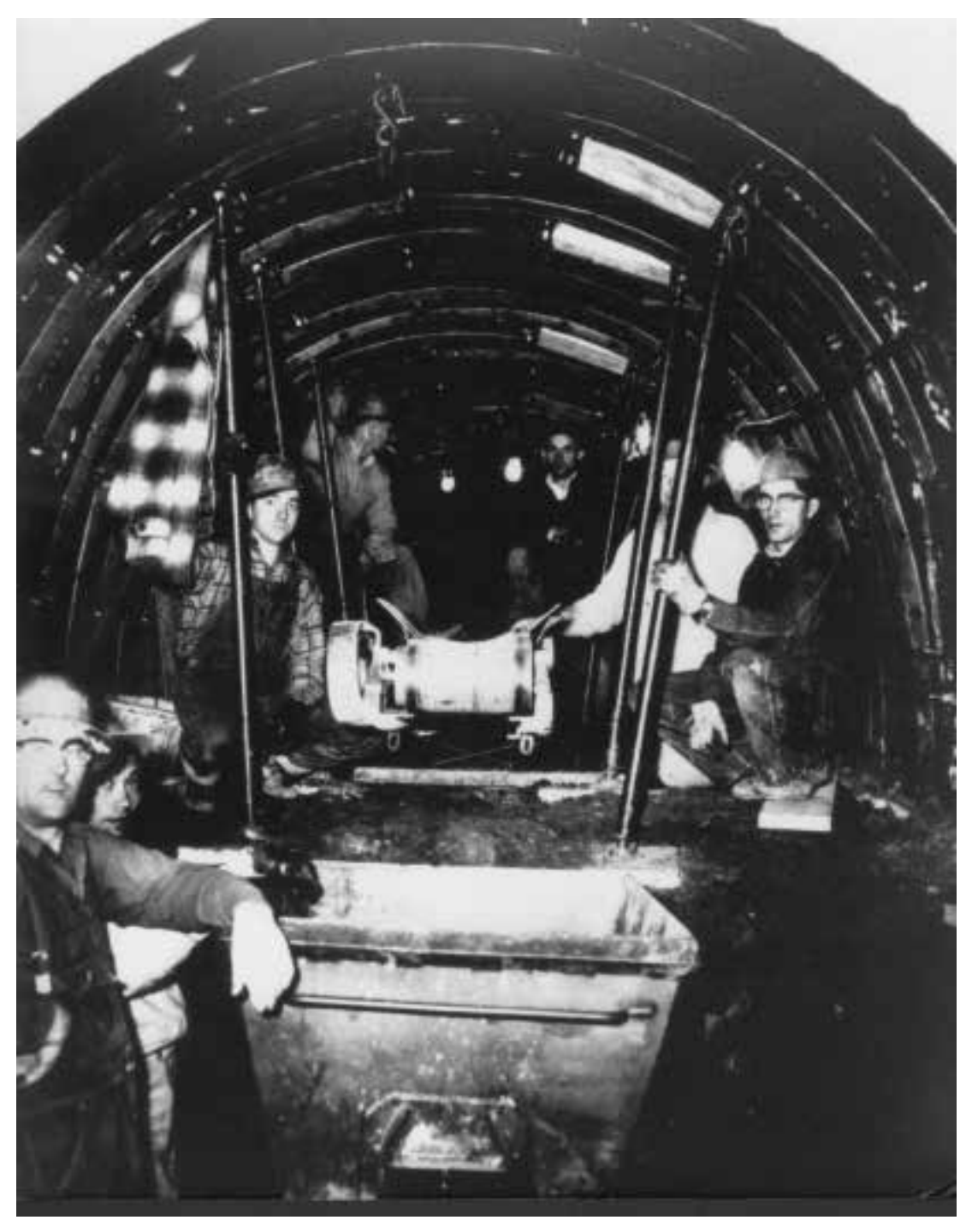
1950 National Union of Public Employees, Local 30 sewer construction workers. Sewer construction, like coal mining, is a dangerous occupation. Through the efforts of the union movement, it has been made safer.