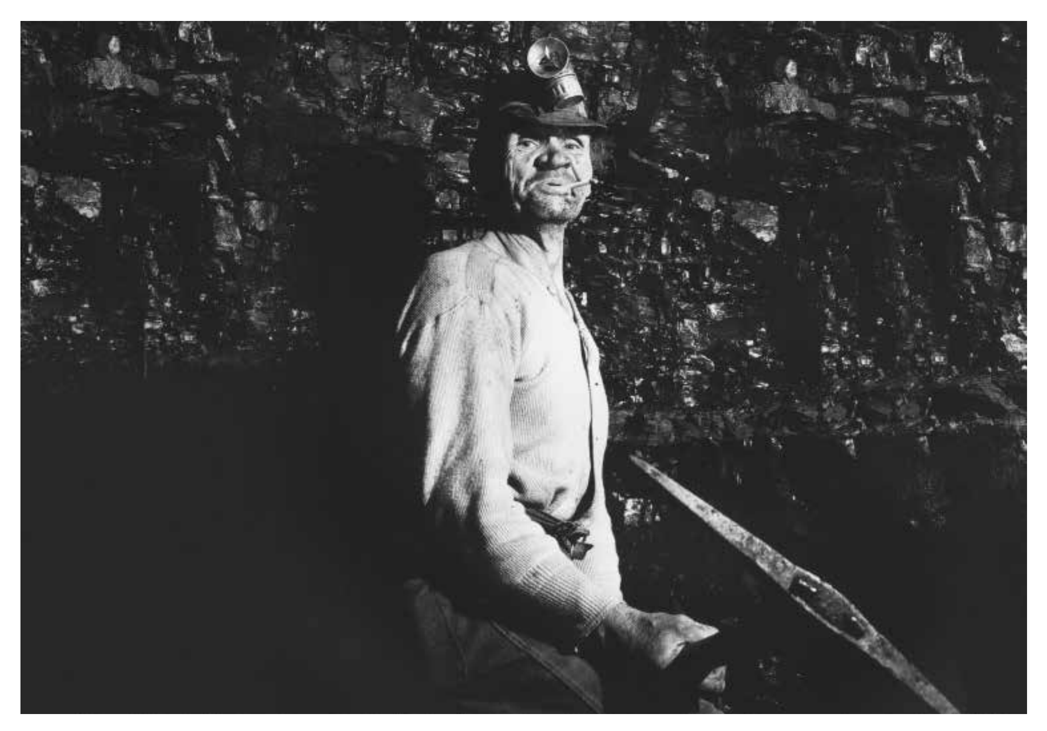
1947 — Edmonton coal miner. Coal mining has always been a dangerous occupation. But the efforts of the unions led to the introduction of life-saving changes in the operation of the industry.