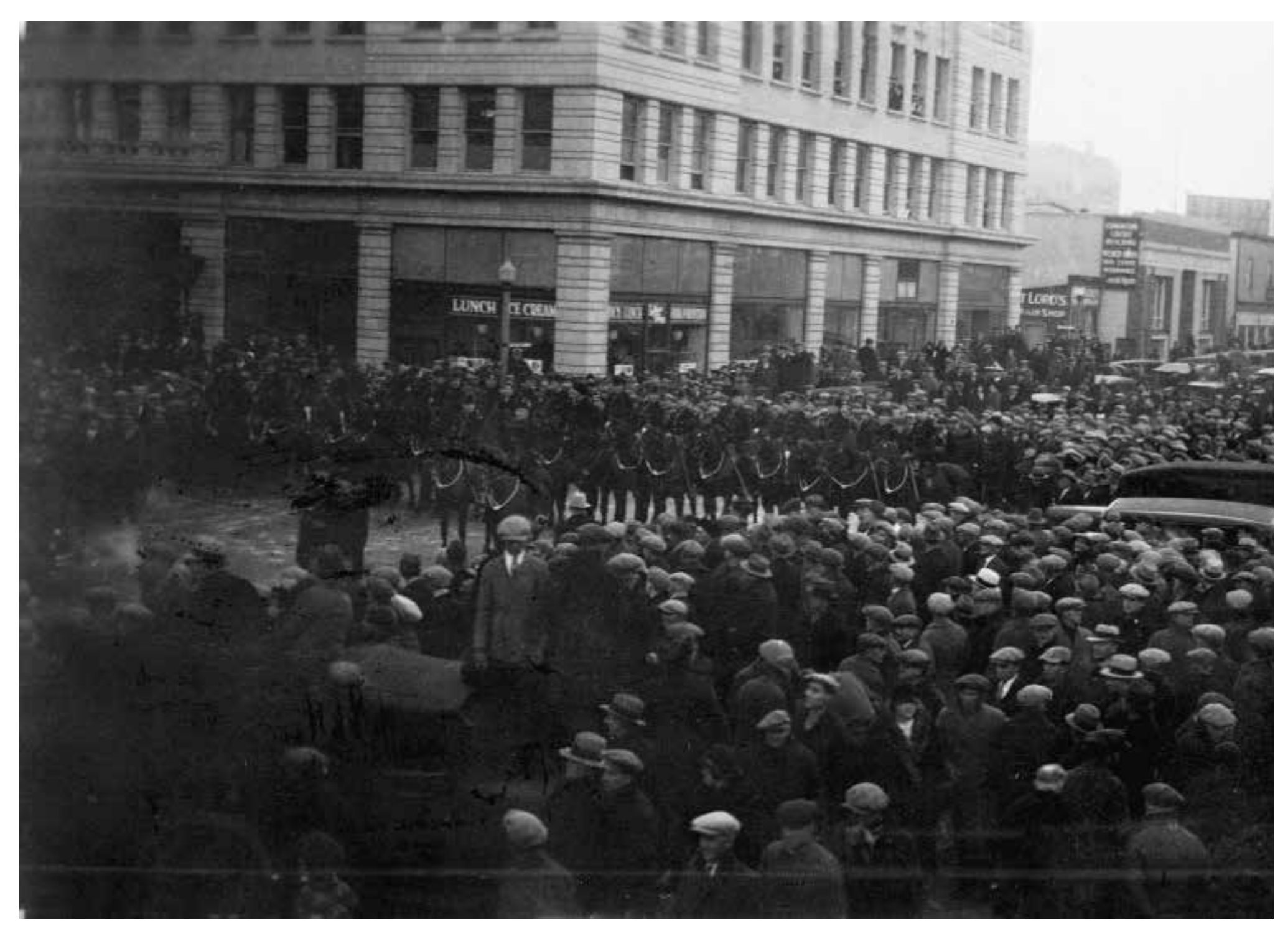
Police repression was much in evidence during Edmonton's Hunger March of December 21, 1932