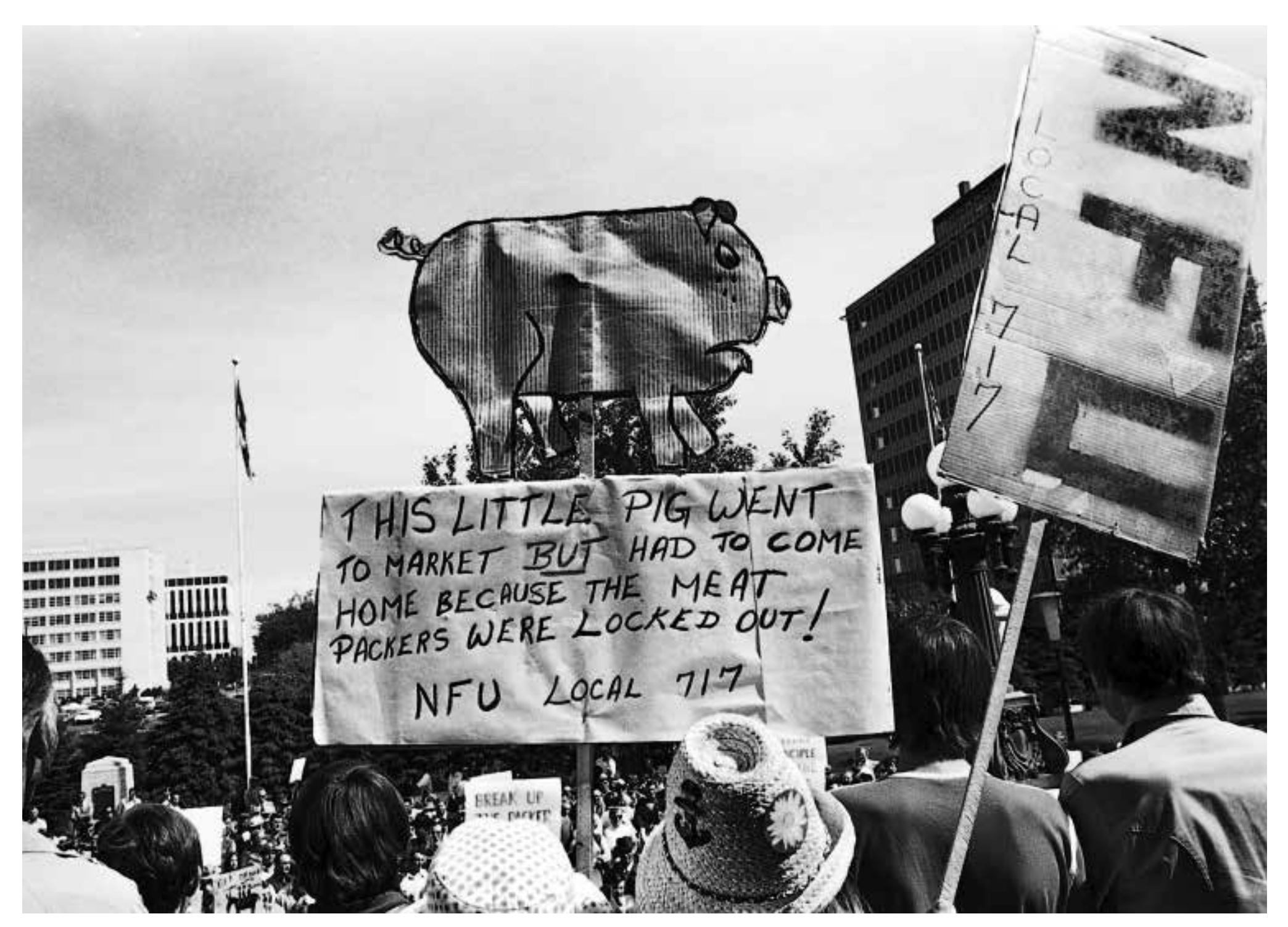
1974 Two thousand progressive farmers march on legislature in Edmonton to protest meat packers lockout