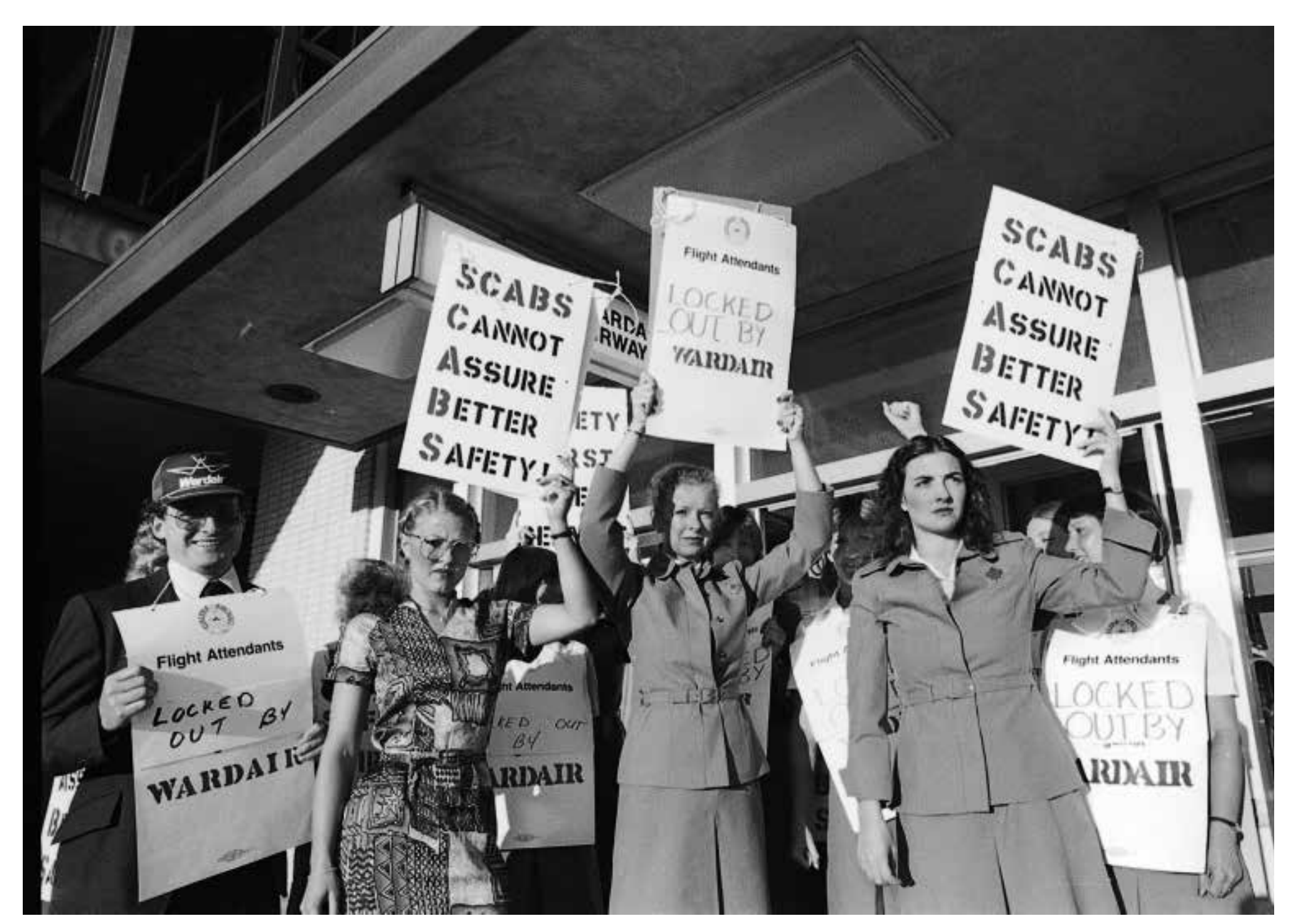
Wardair flight attendants struck for two months in 1973 to win a first contract