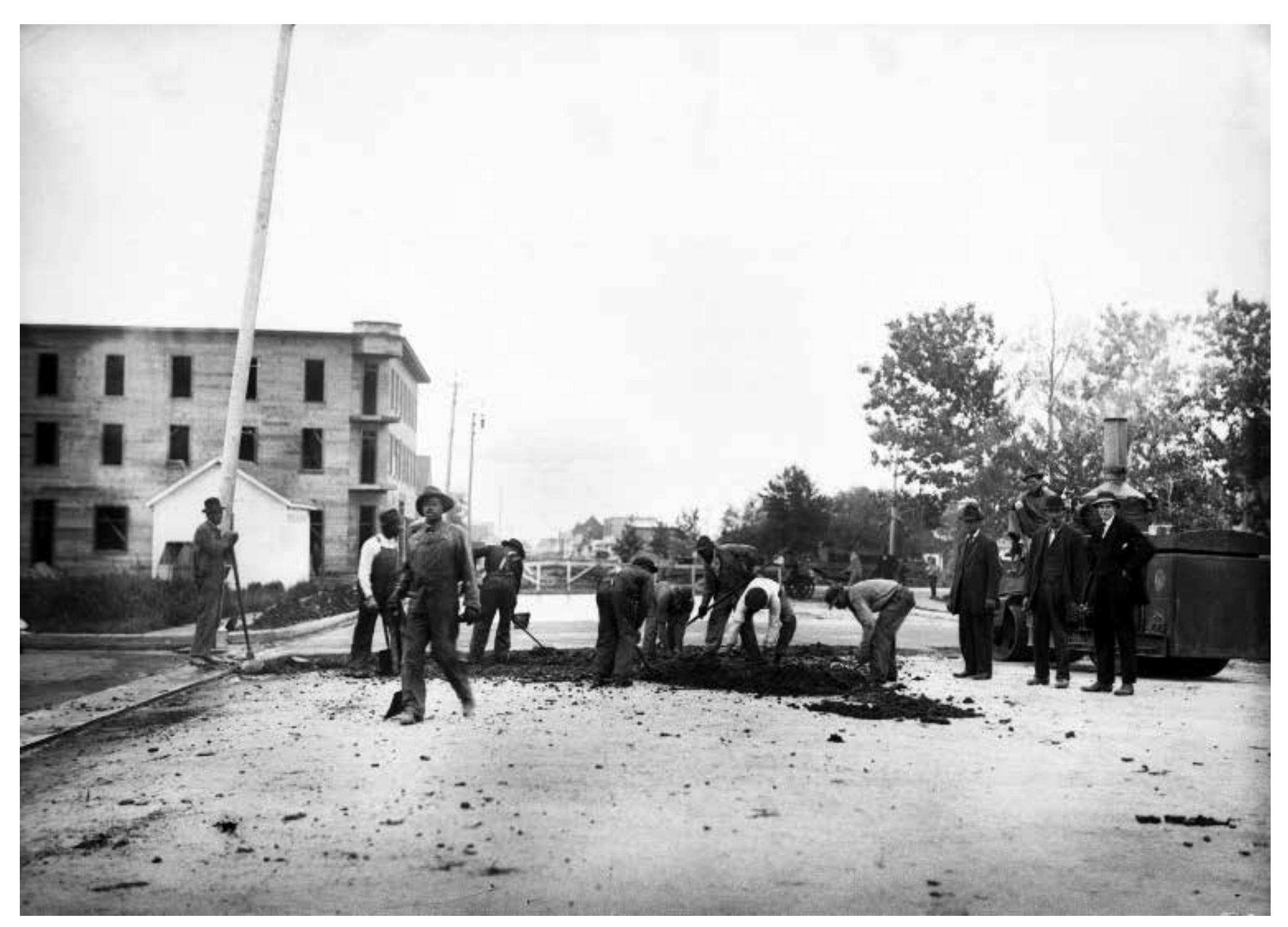
In the early 1920s manual labour was the most common type of work readily available to African Canadians