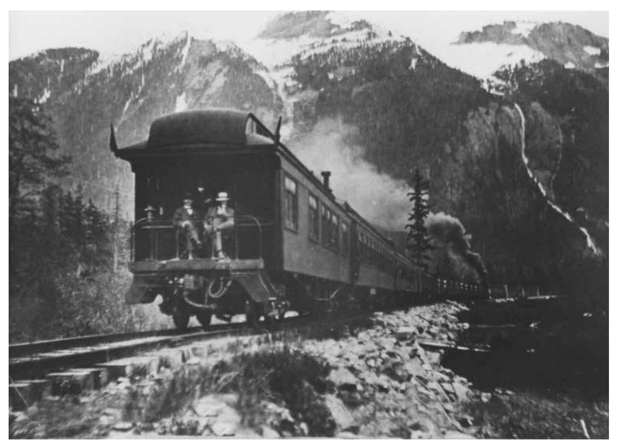
Throughout the twentieth century, railway workers have formed an important component of the trade union movement in Alberta