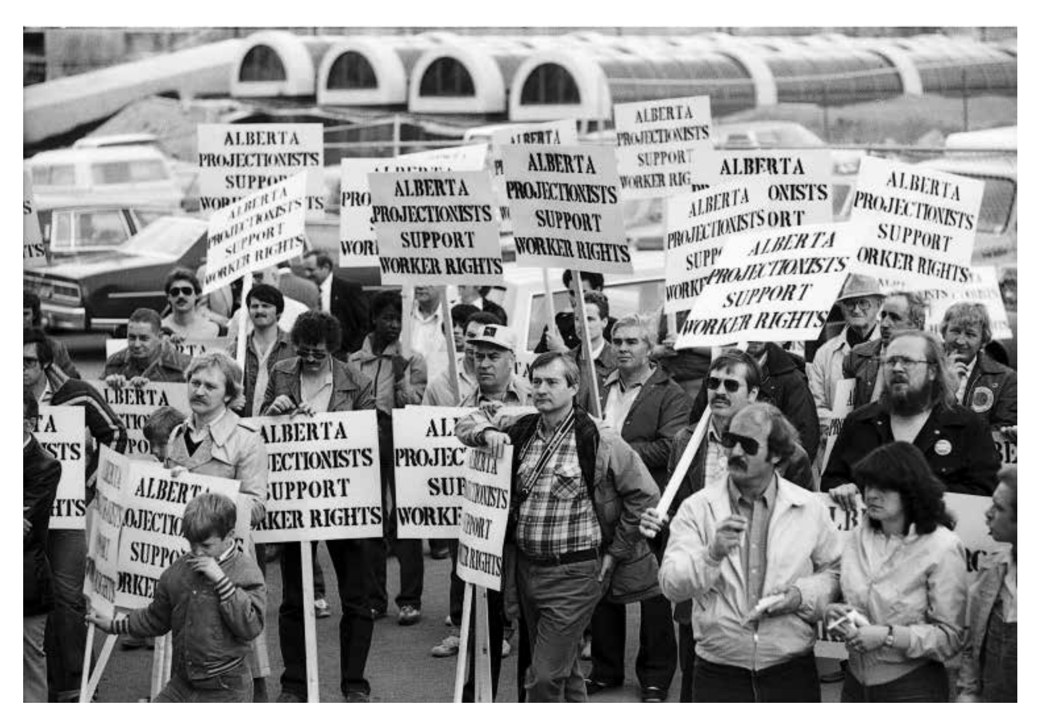
The International Alliance of Theatrical Stage Employees and Machine Operators, struck in 1995 in an unsuccessful effort to preserve their trade