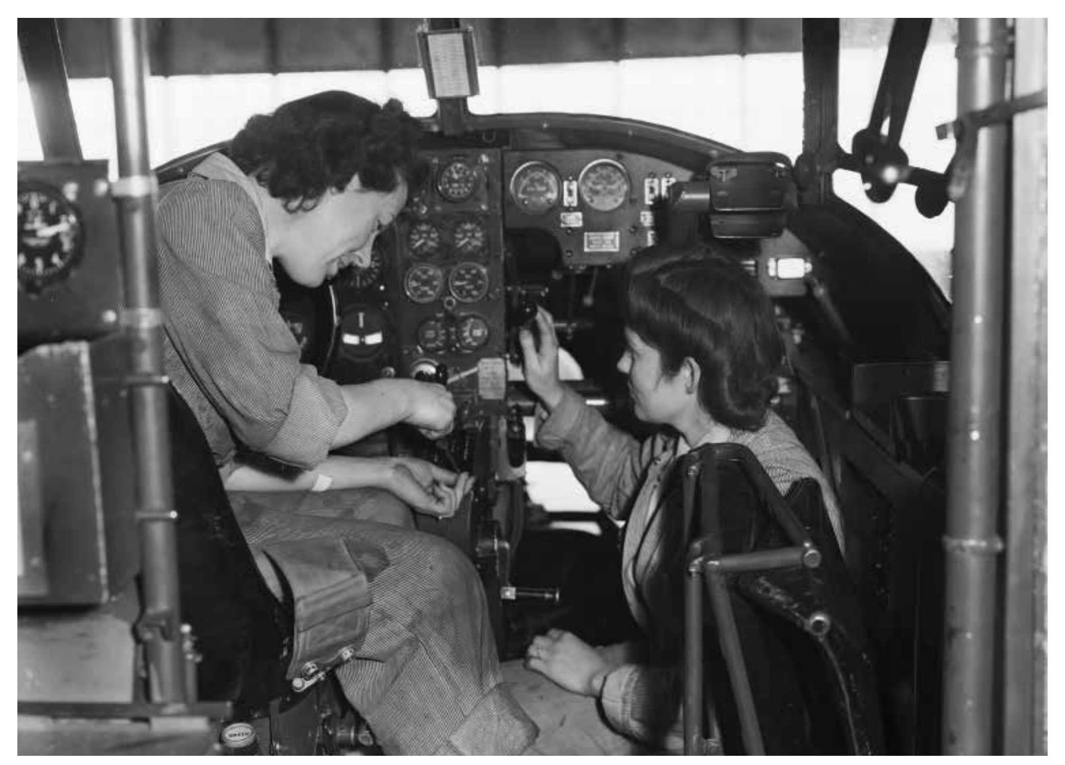
1942 Women war workers work on the cockpit of an airplane