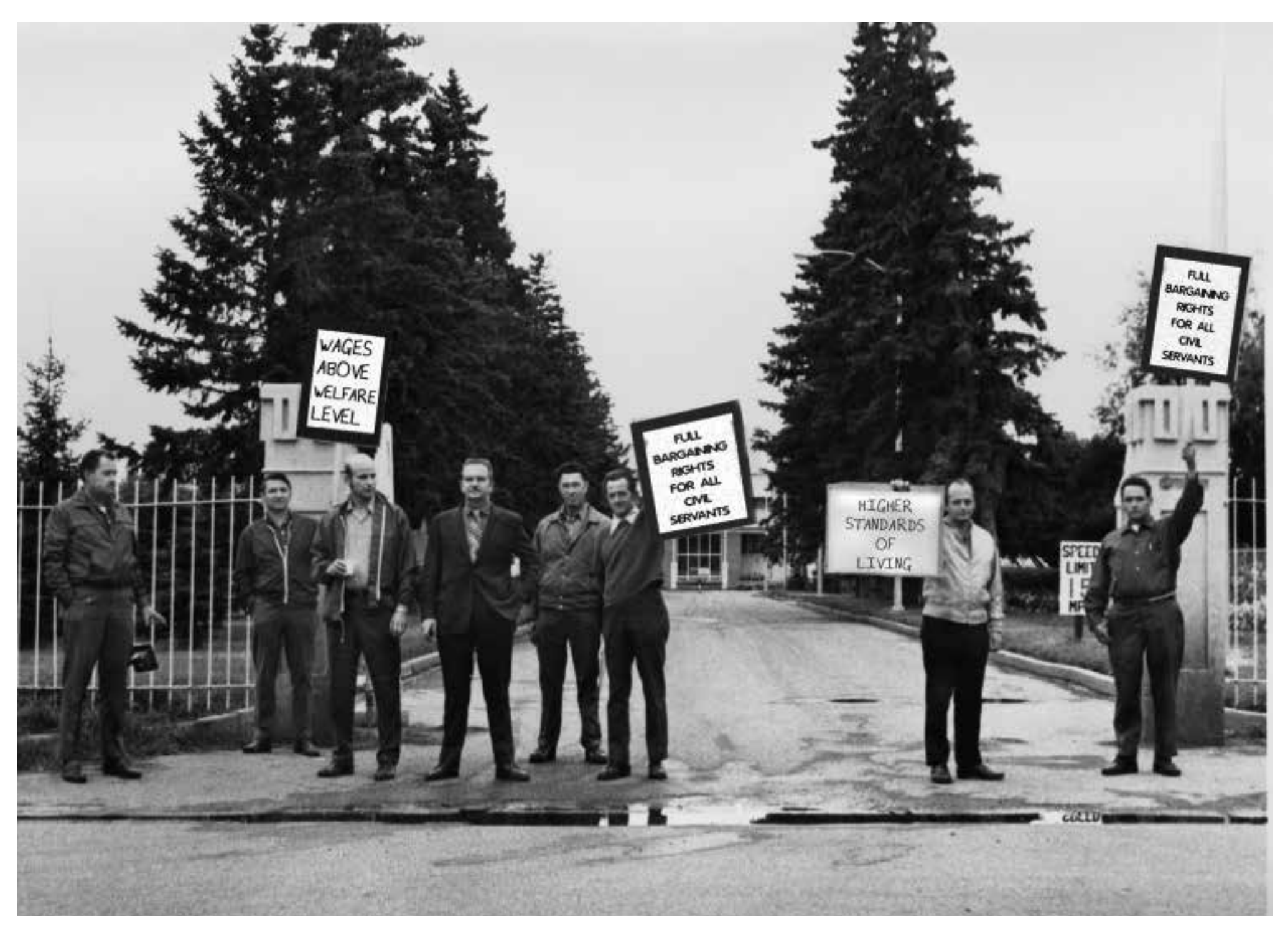
August 1971 Fort Saskatchewan correctional officers, members of the Civil Service Association, staged legal walkout