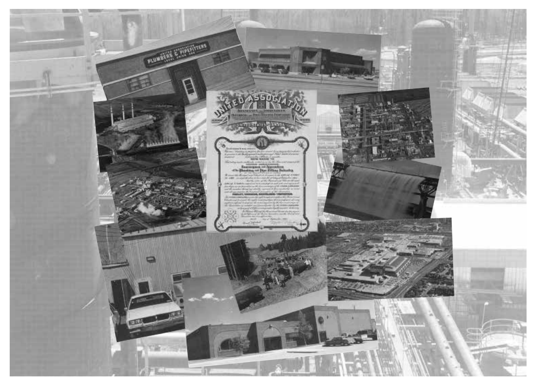
In September of 2004, the Plumbers and Pipefitters Union, Local 488, celebrates 100 years of building Alberta