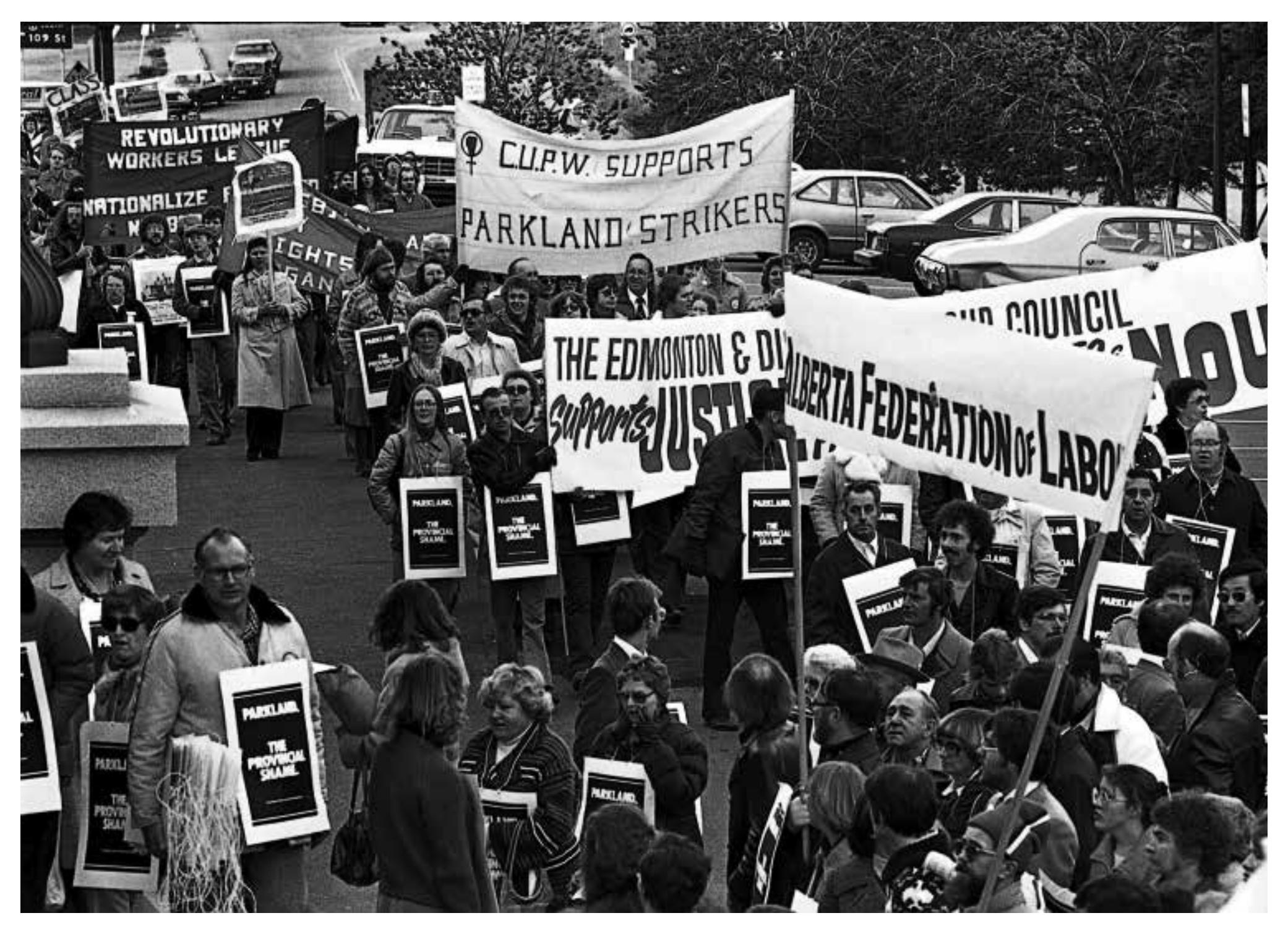
March 17, 1977, Canadian Union of Public Employees local at the Parkland Nursing Home in Edmonton began a legal strike