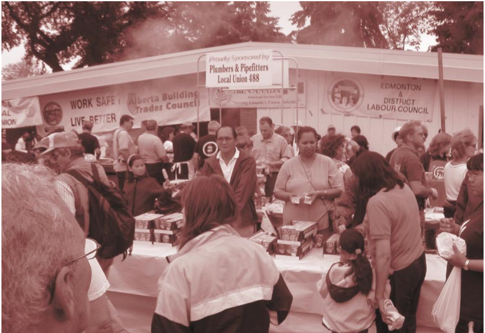
13th Annual Labour Day barbeque sponsored by the Edmonton and District Labour Council, 2002