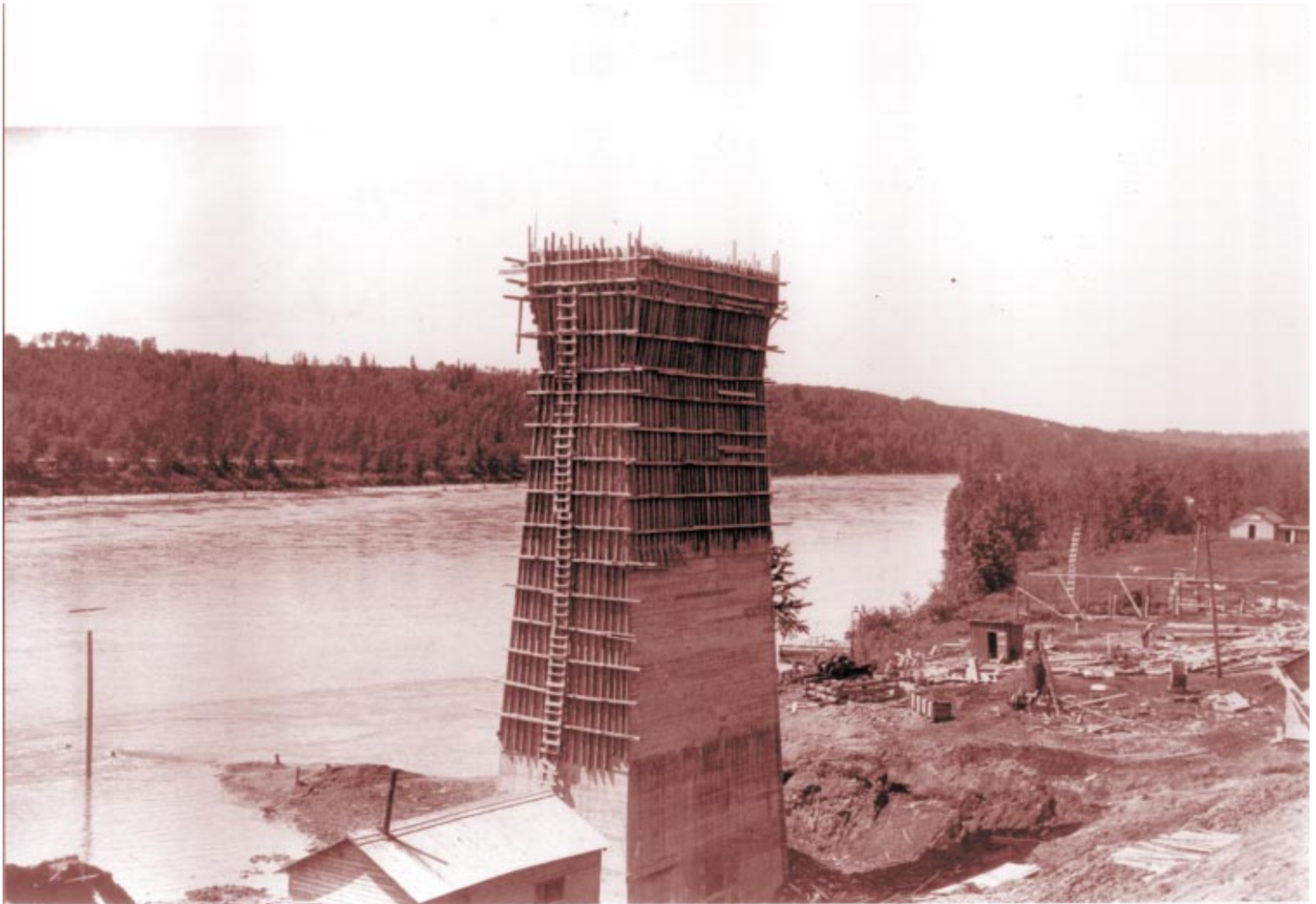
1911 The building of the High Level Bridge in Edmonton by United Brotherhood of Carpenters & Joiners, Local 1325