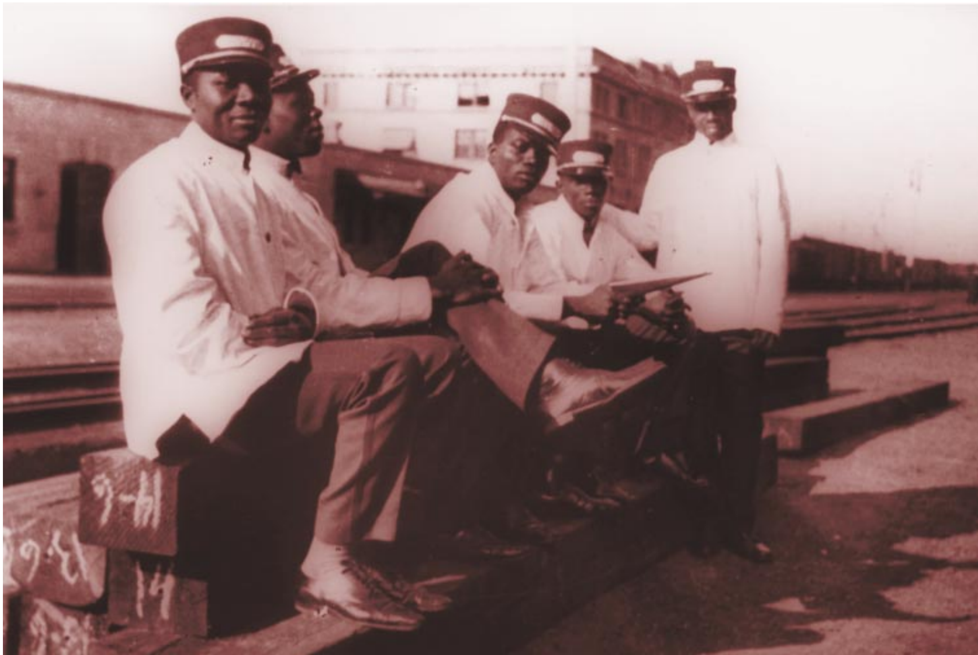
Canadian Pacific Railway Black Porters c. 1920s — Through their unions, such as the Brotherhood of Sleeping Car Porters and the Order of Sleeping Car Porters, they gained recognition for Blacks within the labour movement