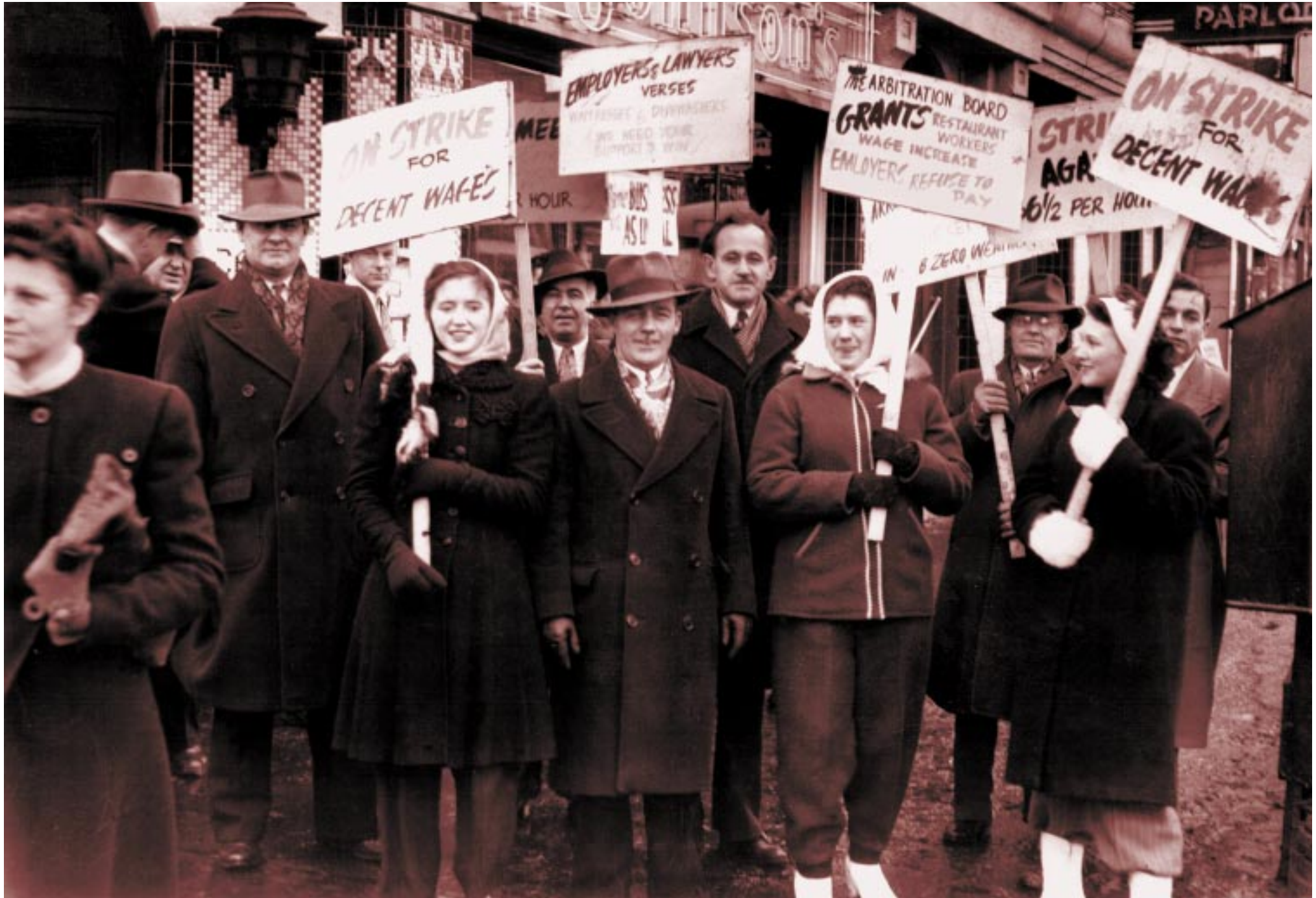
Hotel Employees Restaurant Union members on strike in Edmonton c. 1940s