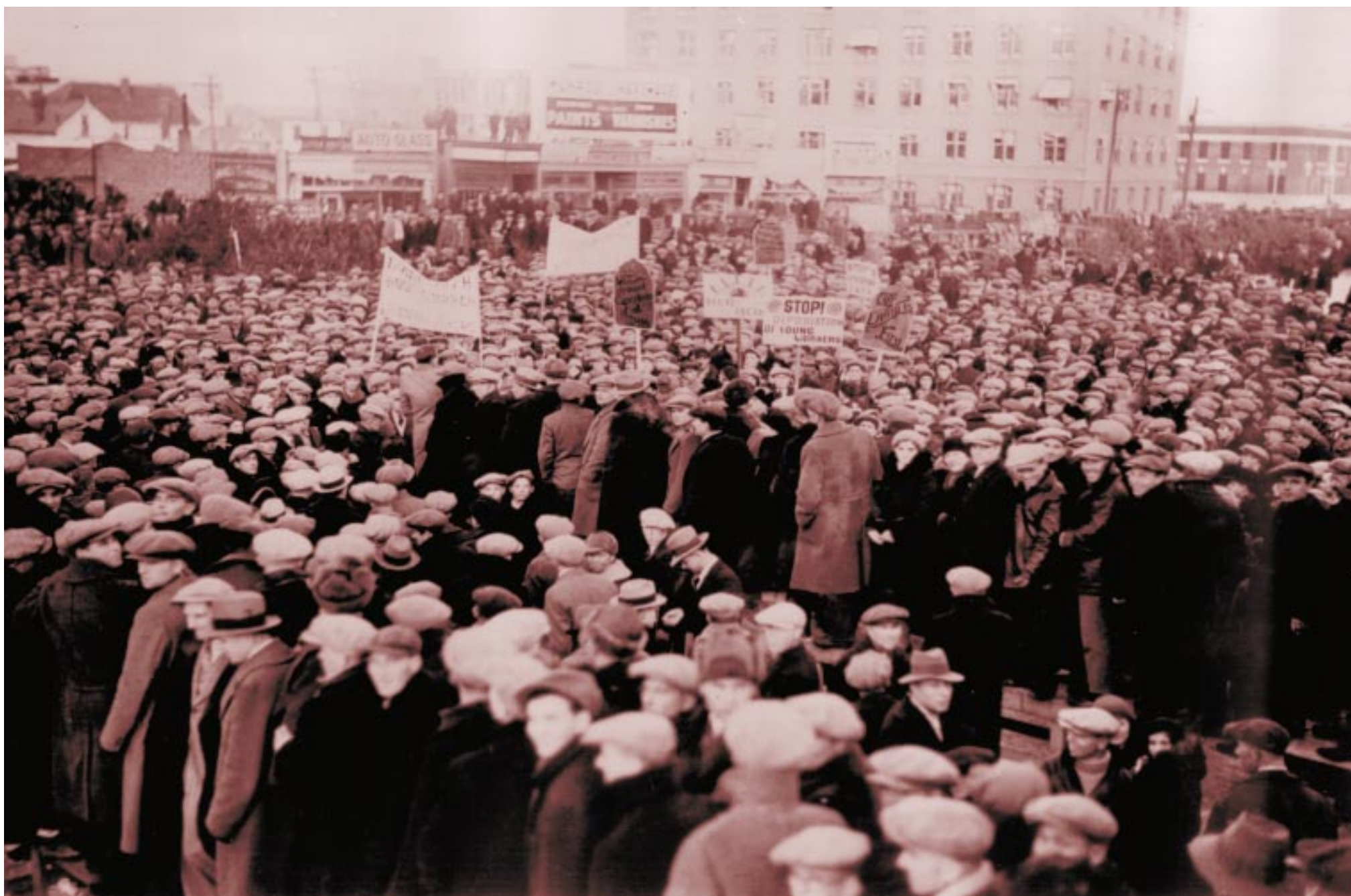
Edmonton Hunger March 1932 — organized to demand relief for farmers and employment for workers. Over 12,000 workers and farmers participate