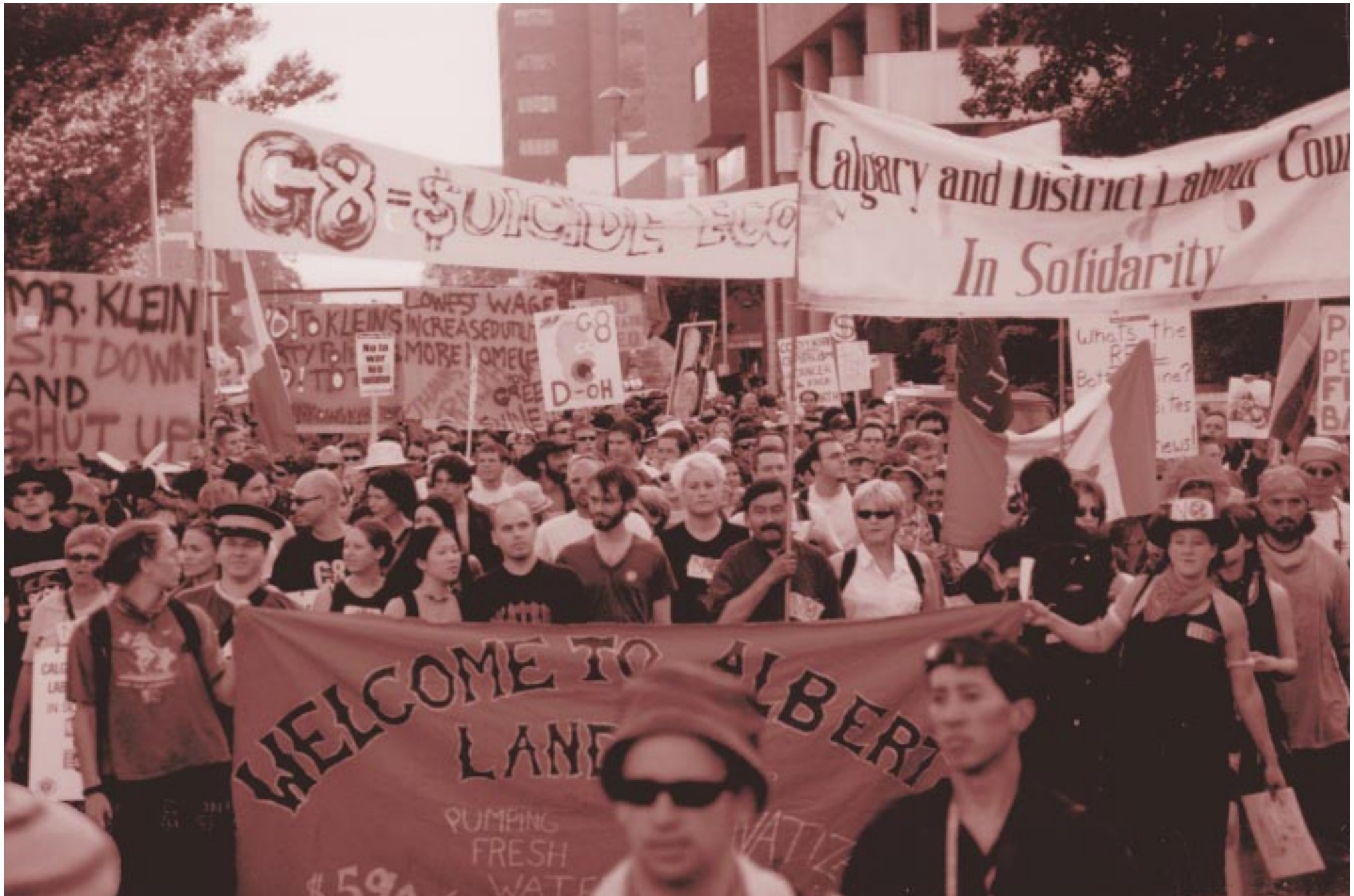
To protest the meeting of the G8 in Kananaskis, Alberta, labour mobilizes activists across North America, June 2002