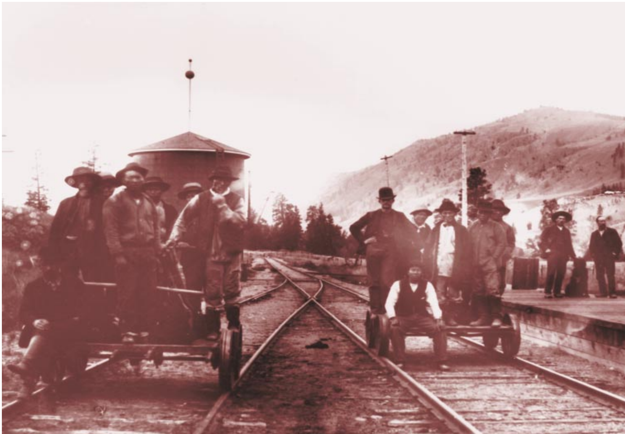
Group of Chinese section workers on handcars CPR