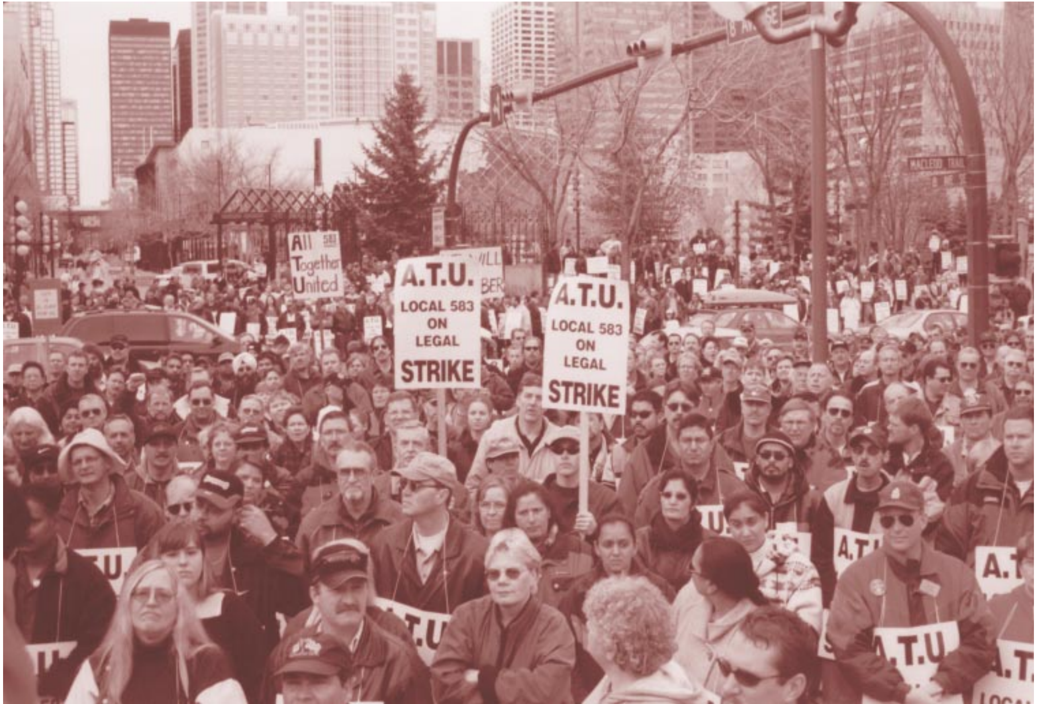
Amalgamated Transit Union Local 583 strike rally at City Hall, Calgary, March 2001