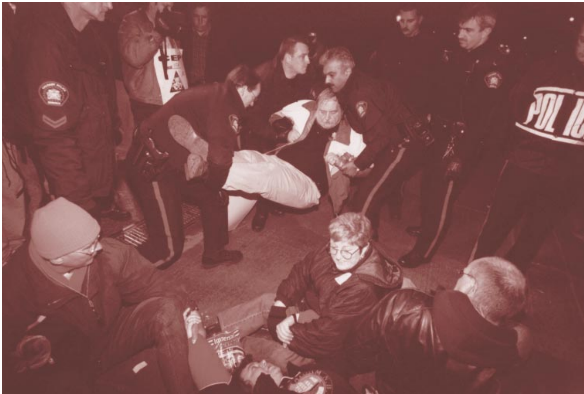
CEP Picket at Calgary Herald — locked out by Conrad Black when union tried to finalize first contract 1999 - 2000