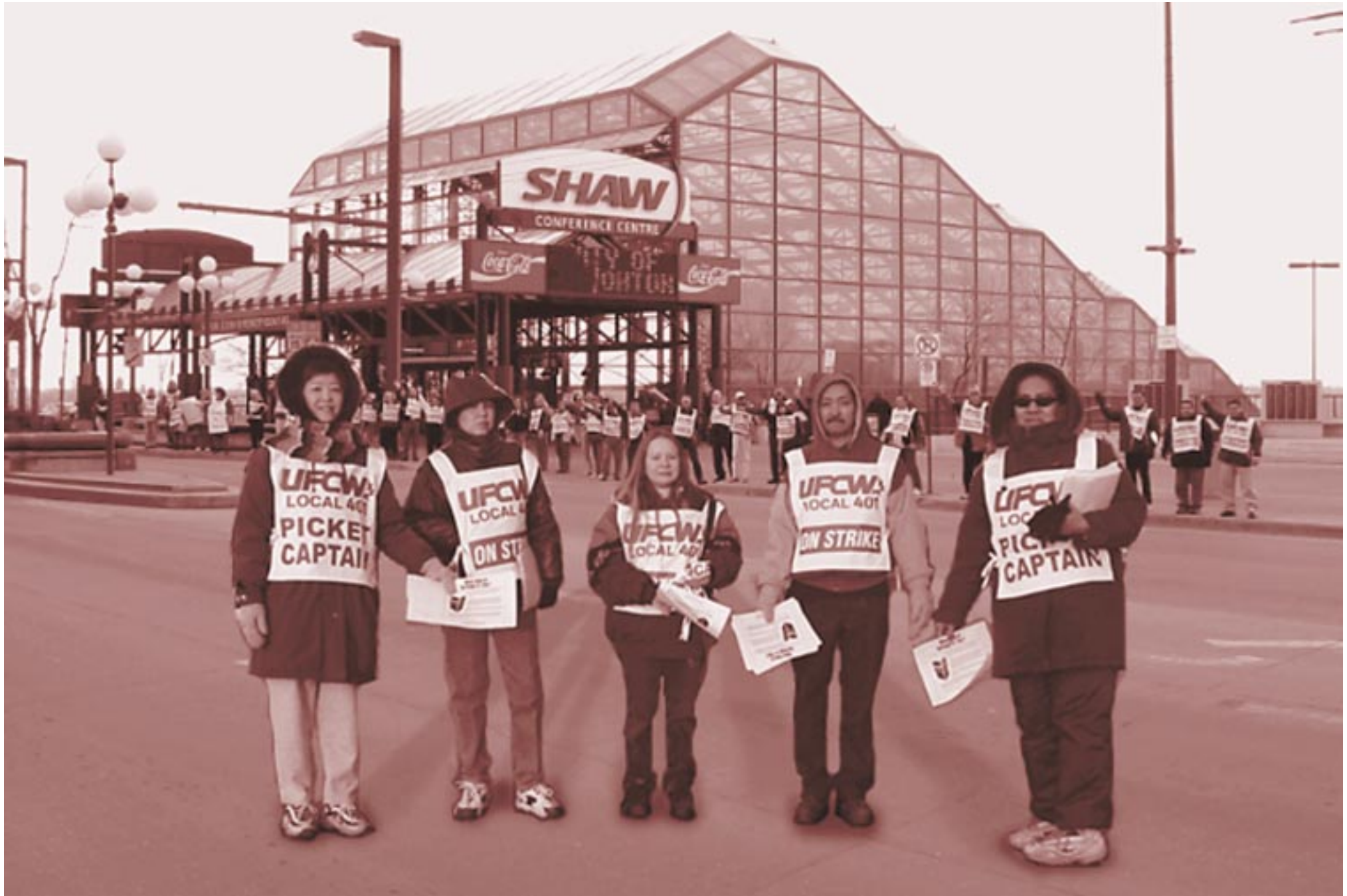
UFCW Local 401 workers strike against the Shaw Centre in Edmonton, May 2002