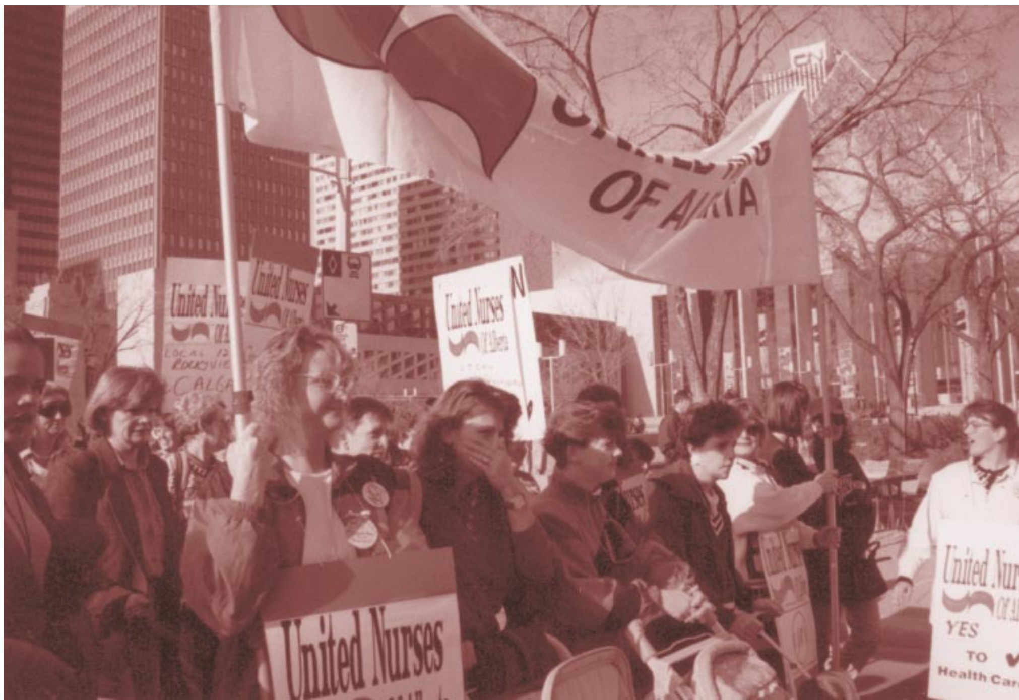
October 1993 United Nurses of Alberta Rally — Health Care and Social Services