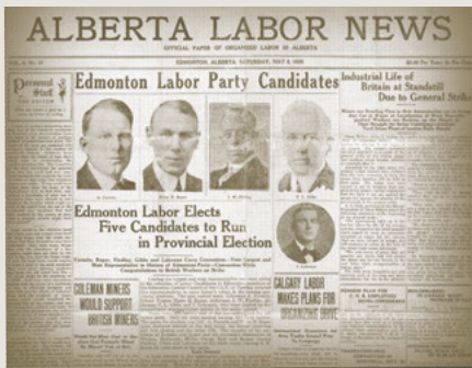
Alberta Labor News article on successful election of labour candidates

Legislative gains in those years included a new Workmen's Compensation Act, followed by many amendments; safety provisions governing scaffolding and building construction; a prohibition on work for children under the age of 16; changes to the Municipalities Act to provide a tenant's franchise; a fair wage policy; abolition of property qualifications for civic office; and the eight-hour day for all government contracts. As a result, during the pre-World War II era, Alberta's labour laws were amongst the best in the country.