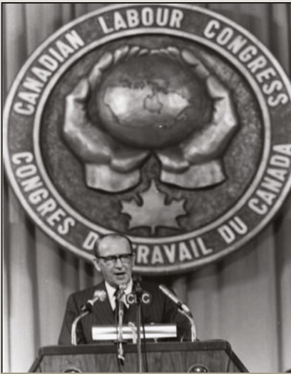
Canadian Labour Congress convention Edmonton 1960's

to merge into one union central. A year later, their Canadian counterparts, the Trades and Labour Congress and the Canadian Congress of Labour, followed suit forming the Canadian Labour Congress.