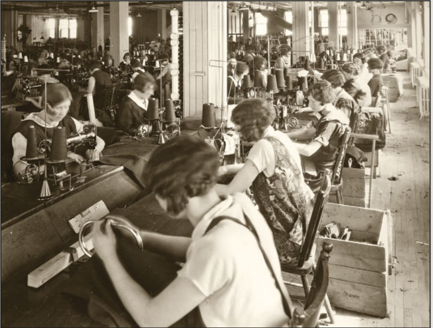
Skilled vs Unskilled: Left, Garment workers at the GWG plant Right, Stone masons building the provincial legislature

little reason to find hope in the gradual reformation of the social and economic system. They had good reasons to seek radical change.