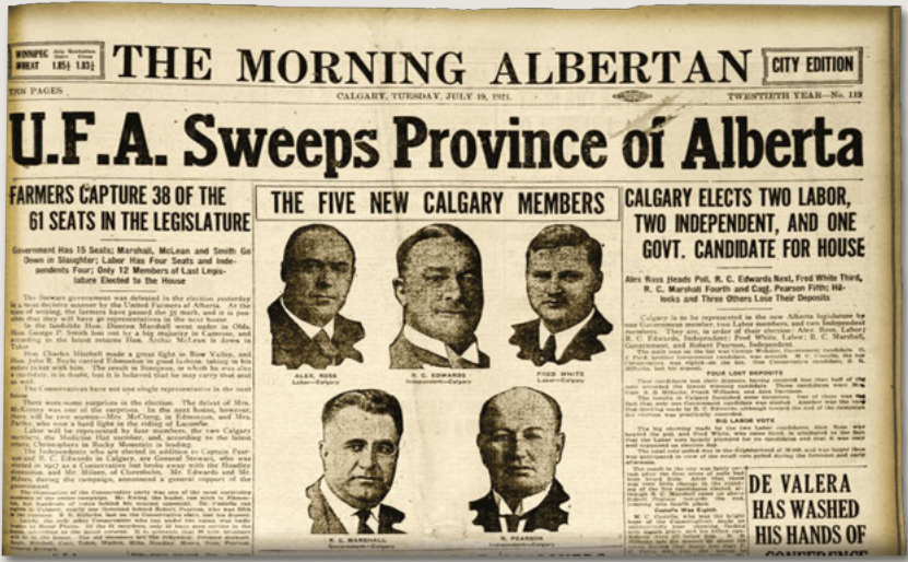
The front page of The Morning Albertan, 1921