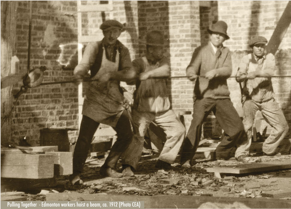
Pulling Together - Edmonton workers hoist a beam, ca. 1912

Left in isolation, bargaining units are easily fixated on specific workplace issues with their employer, and on the narrow politics of a local union. It is easy to forget that every union and union member is affected for good or ill by a broad array of economic, social and political forces; for example, by labour laws, policies on unemployment insurance, health care, pensions, international trade agreements, wars and economic depressions.