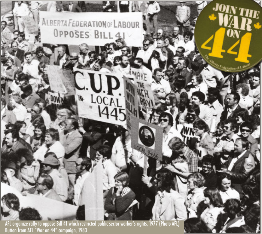
AFL organize rally to oppose Bill 41 which restricted public sector worker's rights, 1977 Button from AFL "War on 44" campaign, 1983

ness self-interest, think tanks with such academic-sounding names as the Fraser and C.D. Howe Institutes were created to present business's case, supposedly grounded in scholarly research. A corporate-controlled media reported their findings as if they were something other than business-funded propaganda.