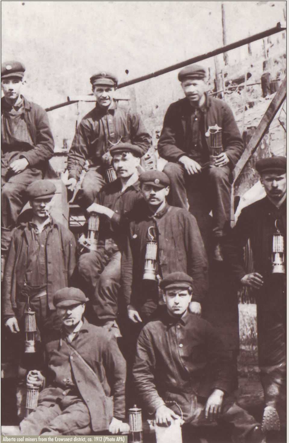
Alberta coal miners from the Crowsnest district, ca. 1912