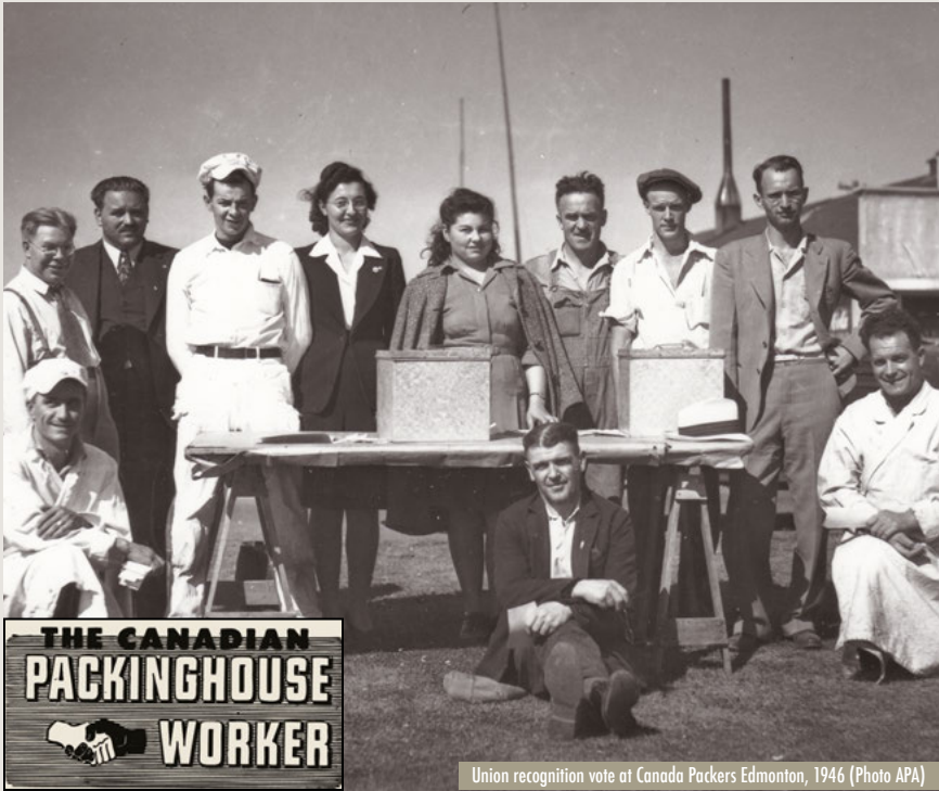
Union recognition vote at Canada Packers Edmonton, 1946

Local 630 at Union Carbide, and a year later organized the Husky refinery in Lloydminster, despite open opposition from the government and company. By 1955, industrial unions had established a base of over 8,000 members in the Industrial Federation of Labour, which included workers in the mines, steel plants, packinghouses, energy sector and on the railway.