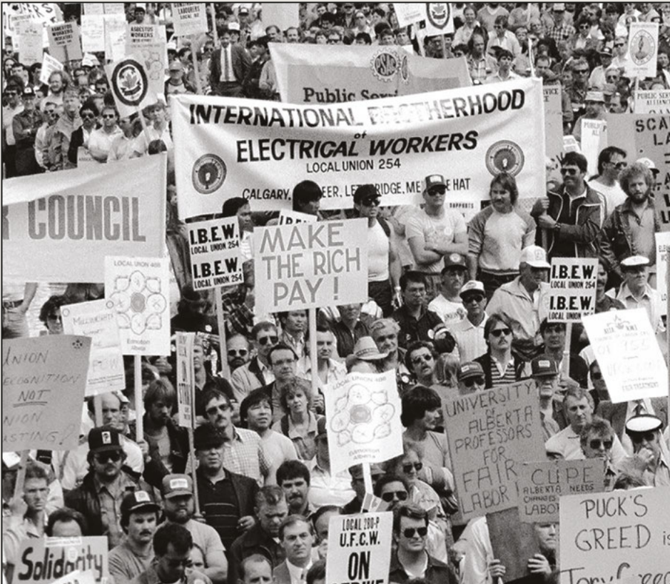
AFL plays lead role in organizing a massive rally in support of workers on strike against Gainers, Edmonton, 1986