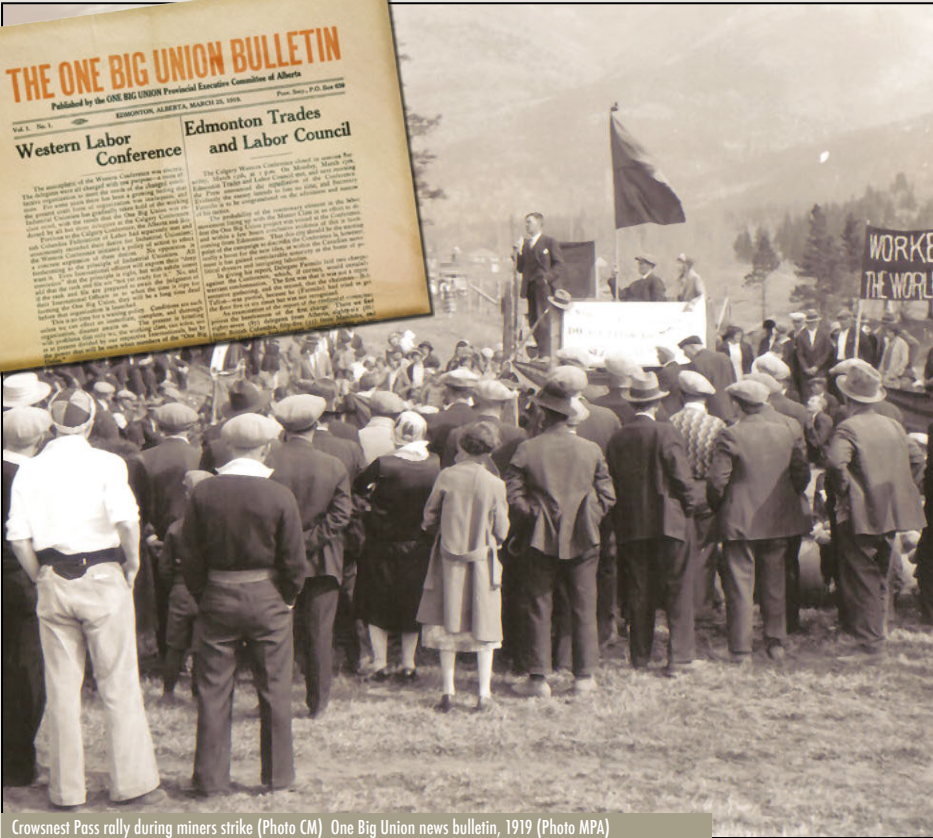
Crowsnest Pass rally during miners strike One Big Union news bulletin, 1919

therefore had a major impact on the Federation. When present in strength, they pushed the boundaries allowed by the craft unions, formulating demands for first a socialist and then a communist political allegiance. They passed AFL resolutions during WWII calling for the nationalization of all war industries, as well as the banks and other key industries, for free universal health care, and for national unemployment insurance. In 1923 the Nacmine union local proposed that since the “burden of poverty and unemployment fall with crushing effect upon