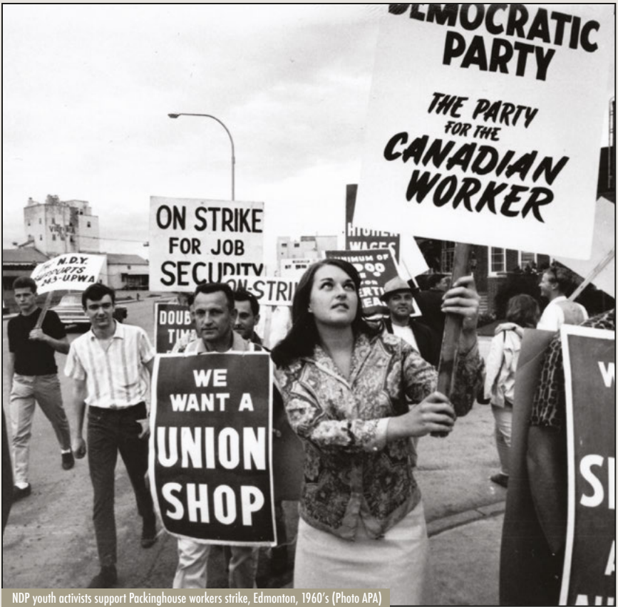
NDP youth activists support Packinghouse workers strike, Edmonton, 1960's

strike by the Canadian Union of Postal Workers (CUPW) in 1965 led to the passage of the Public Service Staff Relations Act (PSSRA), thus opening the door to collective bargaining for government workers across Canada.