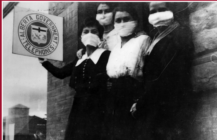
Cover Image: Telephone operators wearing masks, High River Alberta, 1918-19.